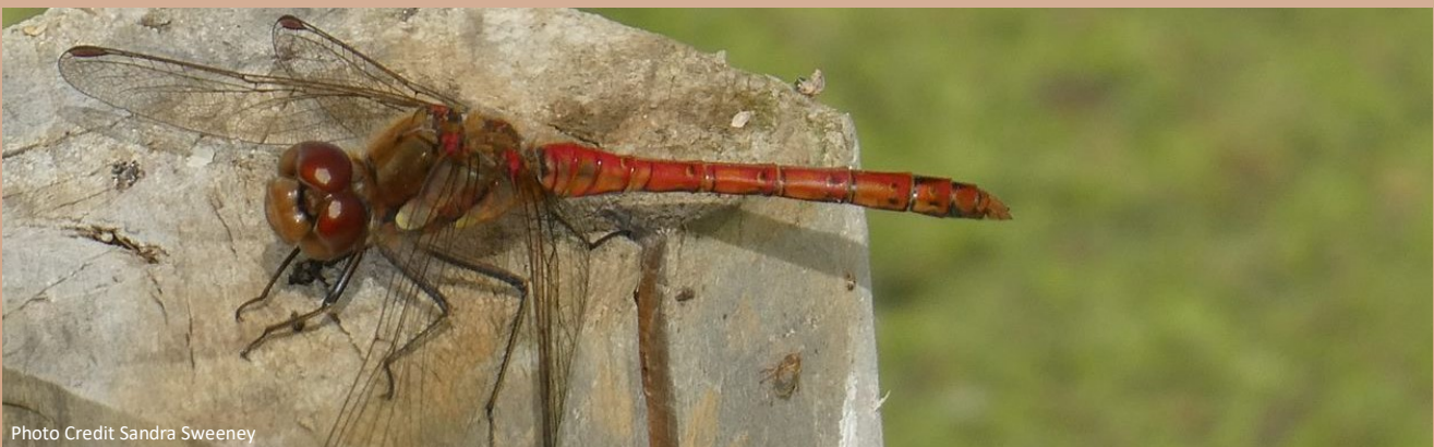
Common Darter Dragonfly