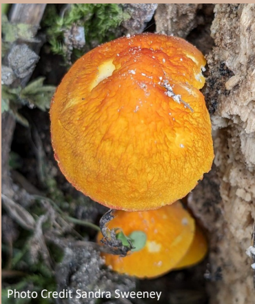
Laughing Gym Mushroom